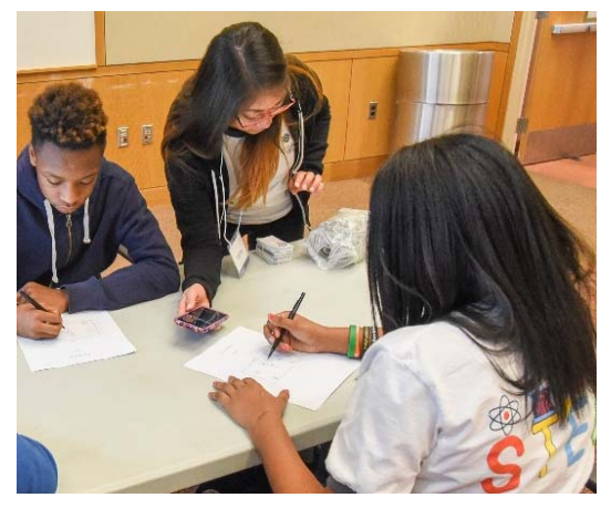
Saturday Academy participants engage in activities with the Jefferson Concussion Center

The Saturday Academy program depends on Jefferson student mentors to work with the middle schoolers. More than 20 OT students volunteered - more than any other academic discipline. Their role was to engage the middle schoolers and ensure that they understood what they were learning. The OT students also shared their own success strategies that the middle school participants could replicate, and told them about the OT profession and shared personal stories about why they became interested in healthcare.